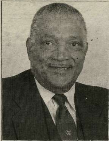
The late former Congressman Charles A. Hayes who died on April 14, 1997, will house a CHA Alumni Hall of Fame board room, a museum of the African American labor movement and a 500 seat auditorium.

The CHA's Charles Hayes Family Investment Center, a state-of-the-art "one stop" shopping facility will offer a comprehensive spectrum of educational, vocational and career development training for the Chicago Housing residents. Serving as the authority's most powerful Welfare to Work tool yet, CHA reports. The center will act as home to the CHA Resident Employment Development Initiative Program which put more than 2,500 CHA residents in work positions last year. The center will also serve as a business incubator resource center for resident-owned businesses and a community meeting place. All CHA residents will be able to access computerized training and assessments at the