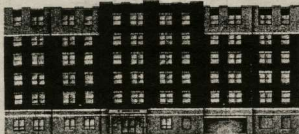
St. Edmund's Tower, a senior housing complex to be located at 6141 S. Michigan Ave.

The HUD 202 Program grant provides Federal Capital advances for rental assistance to assist private nonprofit corporations in the development of new or substantially rehabilitated housing to serve the elderly. Under this program, St. Edmund's Redevelopment Corporation will use the capital advances to finance the construction of St. Edmund's Tower.