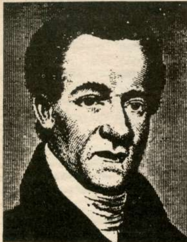
Samuel E. Cornish