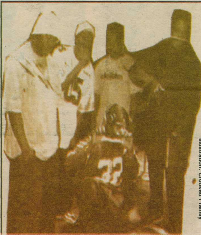
Illustration: Crooked Family

Several noted panelists included Isela Estrada, Amina Norman-