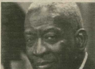
Thomas A. Dorsey, "father of gospel music" played a key role in formalizing the style.