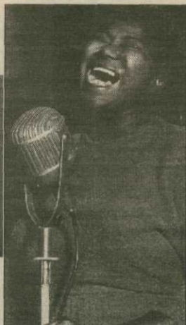
Chicago noted gospel singer Mahalia Jackson who's church was in Englewood at Selma Baptist Church on 71st Street."