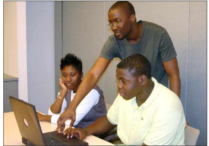
CCNMTL's Web-based application - with games, videos and other interactive features - helps facilitators guide couples through a six-session HIV prevention program.

For more on Design Research, visit http://ccnmtl.columbia.edu/dr/ .