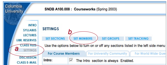
Fig. 1: The Face Book is available from the Settings page for each course

On the Settings page, click the "Set Members" button. (Fig. 1b)