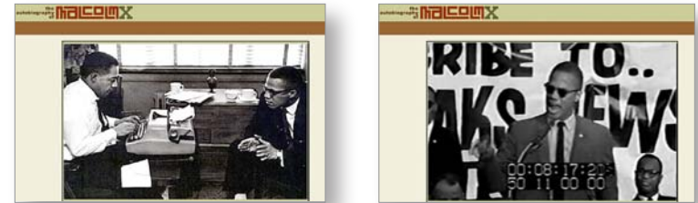
Multimedia samples from The Autobiography of Malcolm X MSE.

In addition to presenting the entire text of The Autobiography online, all of the MSE's annotations and multimedia assets are cross-referenced and fully searchable. The MSE also provides references to additional bibliographic and Web-based resources for further research, making The Autobiography of Malcolm X MSE a significant tool for studying Malcolm X's life and historical legacy.