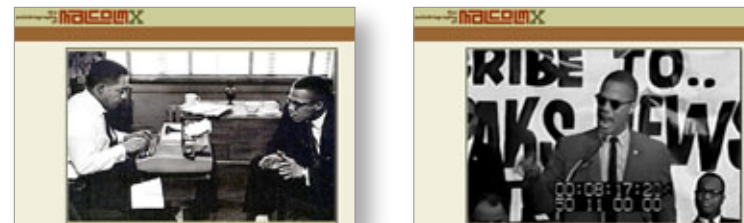
Multimedia samples from The Autobiography of Malcolm X MSE.

In addition to presenting the entire text of The Autobiography online, all of the MSE's annotations and multimedia assets are cross-referenced and fully searchable. The MSE also provides references to additional bibliographic and Web-based resources for further research, making The Autobiography of Malcolm X MSE a significant tool for studying Malcolm X's life and historical legacy.