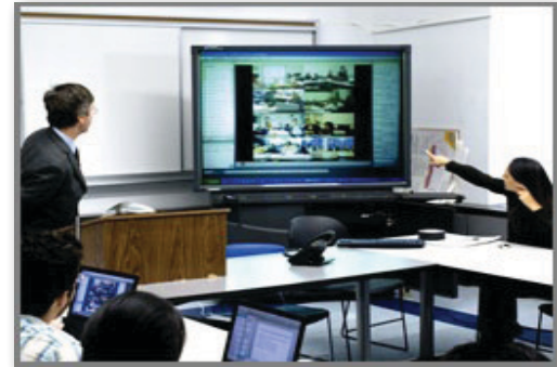
Project partner, Jeffrey Sachs, gives a lecture for the Global Classroom project.

Sustainable development is a worldwide responsibility and through online meeting rooms, video, live chat, and discussion boards, the Global Classroom project provides a truly global academic setting